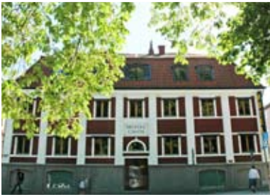
The Torell House as seen from the English Park.

I n a red house opposite the English Park, Varberg's oldest hotel is situated. The guests who stay here soon notice that this is a place with a difference. The bath that is built in the