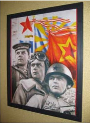
Assassins of German fascism.

Besides Torellska Huset (the Torell House) from the 18th century, Gästis consists of four other houses that are built together by means of winding corridors and unlikely systems of staircases. Of the hotel's sixty rooms, all of which have their own personality, not a single one is the same. The size, the height of the ceiling, and the furniture differ from room to room, whilst the standard and technical facilities are all the same. What is characteristic of the rooms at Gästis