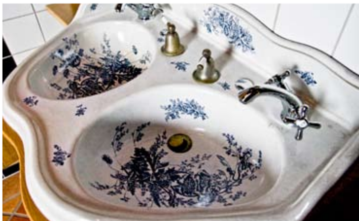
Double hand basin from Rörstrand (Swedish porcelain) with elegant flowery pattern, approx. 1890.

the course of his life. In this collection, there were a number of objects that were similar to those that had adorned the original Lenin Baths.