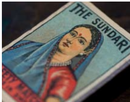
Indian colonial matches.

The selection of goodies in the breakfast buffet is considerably greater than what was offered in the 1940s. Today's