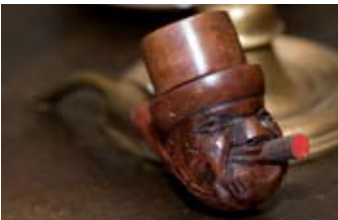
Winston Churchill in the shape of a pipe.

berg for more than fifty years. Single men used to come here for their evening meals and many of them had their own places at the table and could leave a napkin and half a bottle of wine until the next day. Our guests still appreciate finishing off the evening with a cigar and an after-dinner drink from the