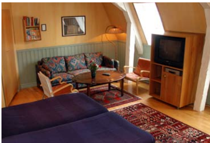
At Gästis, there is no shortage of sloping ceilings or beams from the 18th century.