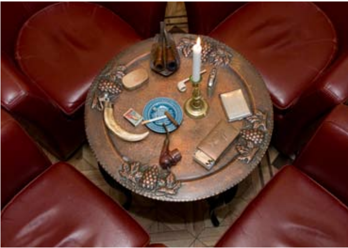
Pipes and cigar cutters on a classical smoking table.

a carefully selected Havana cigar from the hotel's large collection. Here, you will also find the hotel manager's various collections of smoking and tobacco curiosities.