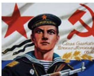
Soviet propaganda poster.