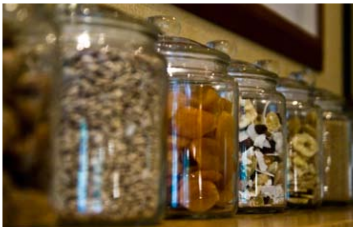
A selection of breakfast goodies.