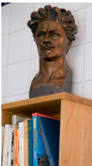
Carl Eldh's Strindberg in the toilet.

After having satisfactorily performed the duties they had intended, our life-loving conference participants are seen stuffing themselves with a three- or five-course slap-up dinner, with an exclusive after-dinner drink, in the old inn's 'eating-room' to round off. Other good sides of life are also at our guests' dis-