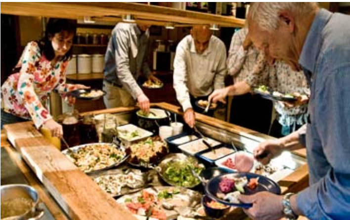
At Gästis’s buffet, anyone who loves food will have his fill.

Gästis’s eating rooms was an established concept in Var-