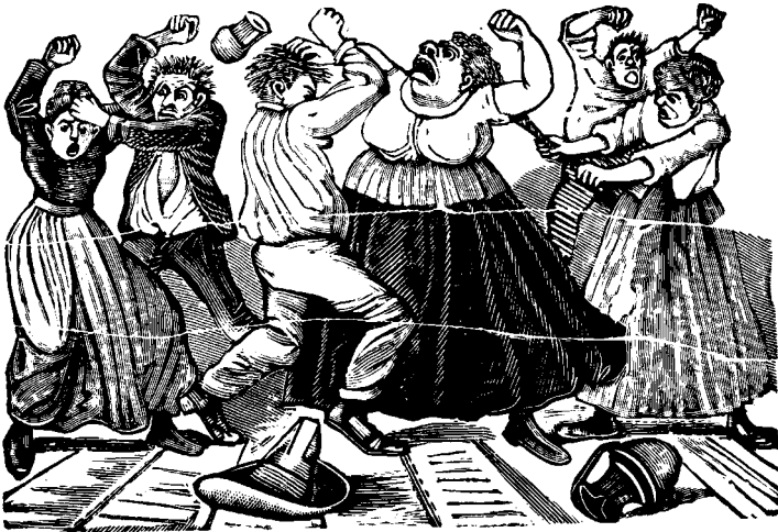
Even during the 19th century, Gästis was popular among ordinary people in Varberg.

there were only about 10 very simple rooms together with a pub that served food, beer and Swedish schnapps. Gästis didn't always have the best reputation among travellers at this time. However, the people who lived in Varberg, who seldom travelled anywhere, thought that Gästis was an exciting inn where people got drunk, were involved in fights, and where you could hear the gossip of the town.