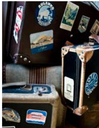
Suitcases that have been far and wide – left behind at Gästis.

— By having these collections, we show that the old inn's air of simplicity and generosity continues to live on, the hotel manager believes. Collecting is a way of life and just as life experiences are interesting, there is nothing that is not worth saving.