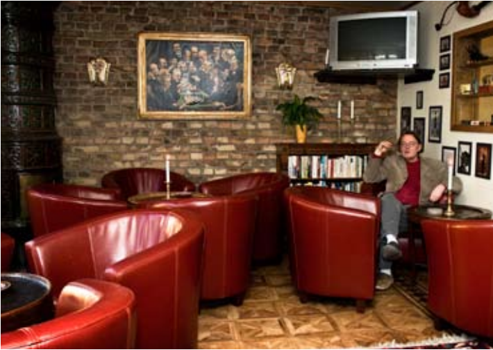
A nice, mild Havanna cigar in the smoking lounge.

berg for more than fifty years. Single men used to come here for their evening meals and many of them had their own places at the table and could leave a napkin and half a bottle of wine until the next day. Our guests still appreciate finishing off the evening with a cigar and an after-dinner drink from the