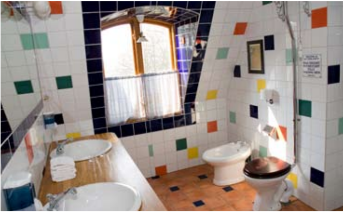
An upper-class toilet with a view of Engelska parken (the English Park).

the years since then, the building has been rebuilt here and an annex has been added there, until we now have a hotel with 60 rooms, 70 toilets and a lift.