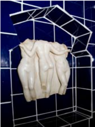
Nook with Russian bath nymphs.