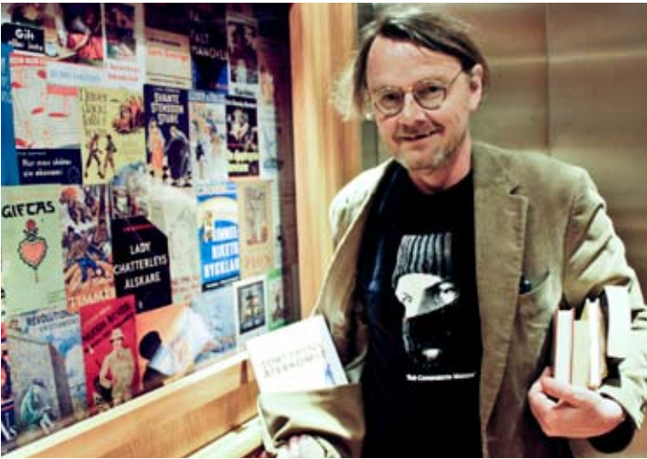
The hotel manager with his books and specially sewn 'book pockets' in front of the lift's moving walls, which are filled with book covers.

Gästis's book shelves are added to when people from Varberg come by with boxes of books that they have inherited, second hand shops get in too many books, and guests hand in a bag of books when they leave.