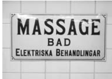
Specialities offered at the Lenin Baths – Massage – Bath – Electric Treatment.

Varberg already had a bath culture at this time. When the railway and steam boats made the west coast of Sweden accessible at the end of the 19th century, it was trendy to travel to Varberg 'to take the (salt) waters' and to drink healthy spring water. Water was fetched from Svartekällan (the Black Spring) in Apelviken south of Varberg to be drunk in the newly-built Brunnsparken (the Well Park) in Stora Torget (the Main Square). The fantastic Kallbadhuset (The