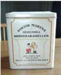
Old tin of throat lozenges. Our hotel cares about the mental and physical health of its guests.

During these years, the hotel has also been filled with collector's items of a more or less worthless nature.