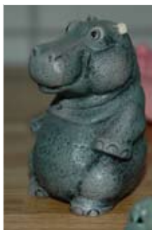
One of a hundred content hippopotami, after his bath.