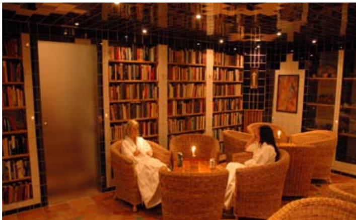
A relaxing conversation in the Lenin Baths' library.