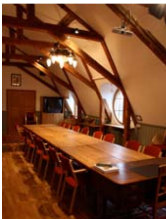
Otto Torell room taking a rest.

Leaving one's usual environment behind for eating good food, browsing among books, smoking a genuine Havana cigar in the smoking lounge, relaxing in the Lenin Baths or just meditating in an old hotel setting, releases the energy that is needed to think in a big way and in the right way. The ambiance and atmosphere at Hotell Gästis has made many conference guests come back to the hotel for conferen-