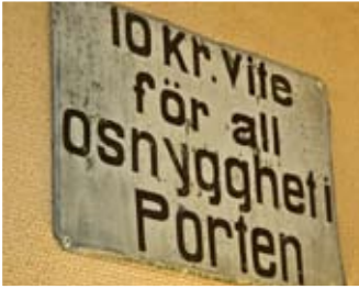
Rules for how to behave – this applies to staff as well as to guests. A fine of 10 crowns for bad behaviour by the main door.

hotel as yet. However, we have more than two thousand items of printed matter from museum shops around the globe.