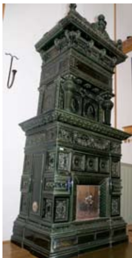
The Rörstrand tiled stove, 1894.

The Strindberg Conference Room with copies of Strindberg's greatest oil paintings on the walls and a Strindberg bust in the toilet is somewhat smaller. Here, there is another tiled stove, a so-called splash-painted stove, which originally stood in a stable in the county of Halland somewhere. In Gästis's old stable, there is the newly-built Gästis Conference Room and the Varberg Conference Room with furniture and fittings that are connected with Varberg's and Gästis's