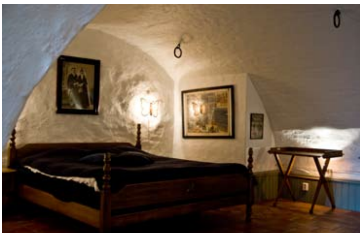
The wedding bed under romantic lamps in the shape of butterflies and a wedding photo of the hotel manager's great grandparents, who lived happily ever after.

The hotel's annex Villa Gästis is situated across the street. It has eleven rooms located in an old private town house from 1894. The entire house is full of pictures from the golden age of Mexican art, from Diego Rivera to Frida Kahlo. In the old vaulted cellar from the 17th century, you can find Gästis's wedding suite. This cellar room with its one-metre thick brick walls was all that was left after a devastating fire in 1889. The hotel's other suite is located in what was the old inn's stable until the turn of the 20th century. It has a separate entrance from the inner courtyard and has a little kitchen for those who are interested in self-catering.