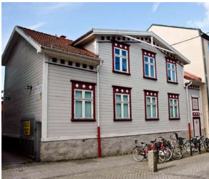
Hotell Gästis annex, Villa Gästis, located in an old town house.