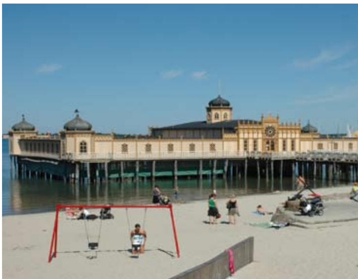
Varberg's beautiful Cold Bath House by the Children's Beach, alive with happy bathers.

posal. Few of our guests miss the Varberg's local market in the Main Square or Varberg's fortress with its Bockstensmannen, (the Bocksten man – remains of a man from the Middle Ages), the bullet that killed Karl the 12th (king of Sweden 1698-1718) and the paintings by Kreuger, Bergh and Nordström, who were members of the Varberg School of Artists. If you go on the town walk, there are other highlights that are unique to Varberg, and if the weather is on your side, you can finish your walk by visiting the fantastic Cold Bath House in Moorish style.