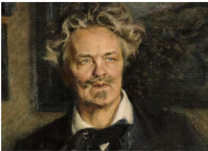
Titan's visionary look is a source of inspiration in the Strindberg Conference Room.