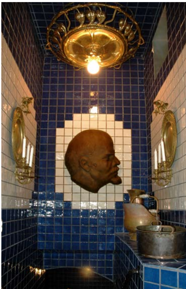
The stairway down to the Lenin Baths with a lamp from the film Gorky Park and a grandiose relief of Lenin in bronze.